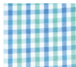
AQUA/BLUE Men's BG7270 Ladies' BG6270

Wear It Untucked! Featuring a soft 55/45 cotton/polyester blend, this wrinkle resistant, muted colorful plaid is perfect for casual days in the office and all other occasions. Designed to be worn in or out, this shirt offers a slightly tapered fit, shorter length and contoured hemline. Spread collar with white pearlized buttons, this shirt also offers a fashionable Y-placket. No pocket. Adjustable cuffs. Sizes are available up to 4XL.