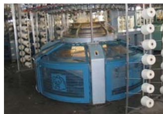
ON SITE KNITTING MACHINES