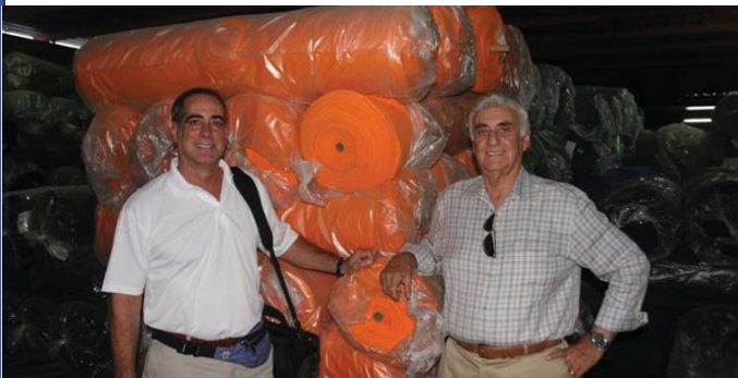
IN STOCK FABRIC FOR QUICK RESPONSE

we have better control over color consistency compared to clients receiving shipments from multiple locations to complete an order." Lastly, Eric notes that Blue Generation's warehouse "stocks millions of garments, making our fulfillment capability unbeatable."