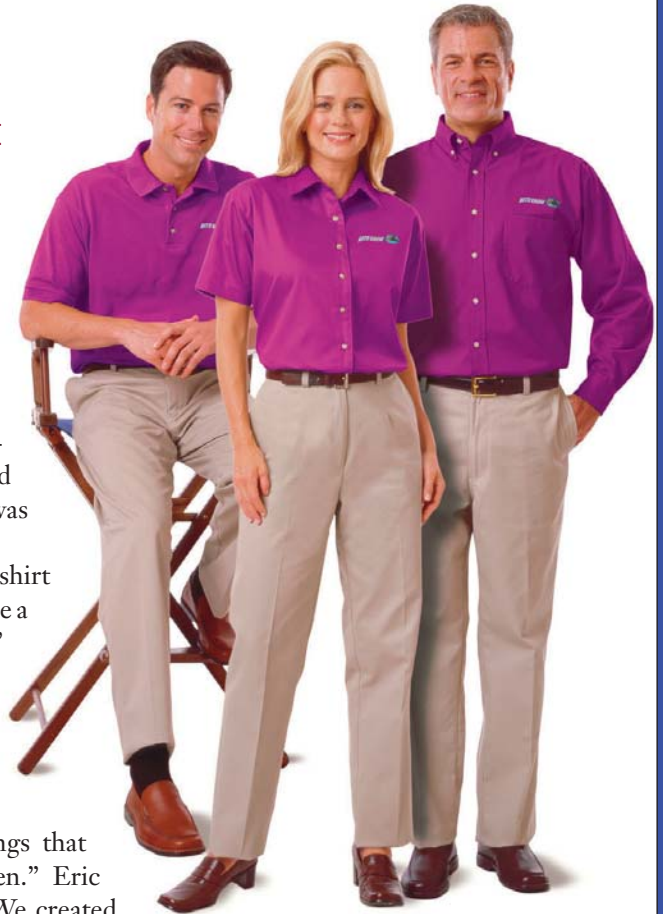
OUTFIT YOUR TEAM IN COORDINATED STYLES AND COLORS

year we are using that expertise and introducing polar fleece vests, pullovers, and jackets” says Phil.