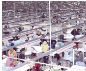
SEWING FACILITY WITH OVER 2,500 WORKERS

are the sewing machines ... more than 2,500 workers in the Egyptian facility alone." "There is a considerable capital investment in the facility," Eric notes.