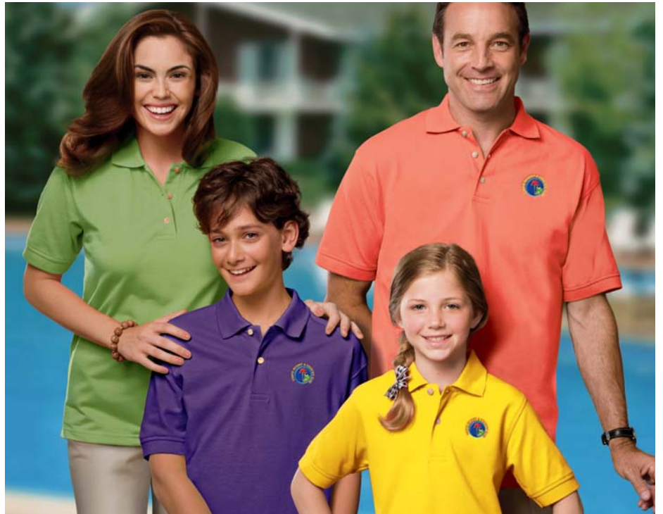
BLUE GENERATION'S EXCLUSIVE "SUPERBLEND" 60/40 PIQUE KNIT

Another way that Blue Generation differentiates itself