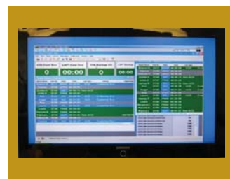
STATE-OF-THE-ART CALL CENTER MONITORS

The rapport that BG’s executives have developed with front-line employees surely benefits the customer as well. “We focus on making this an enjoyable work environment for our employees. If they feel they are treated well, then