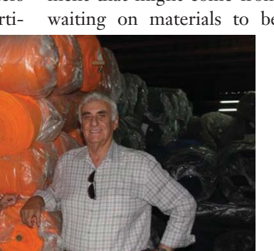
IN STOCK FABRIC FOR QUICK RESPONSE

heard of, and offers customers peace of mind in several ways. First, "there is no possibility of a delay in fulfillment that might come from waiting on materials to be