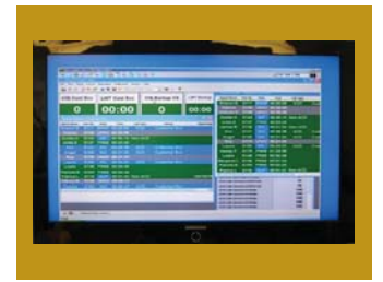
STATE-OF-THE-ART CALL CENTER MONITORS

The rapport that BG's executives have developed with front-line employees surely benefits the customer as well. "We focus on making this an enjoyable work environment for our employees. If they feel they are treated well, then