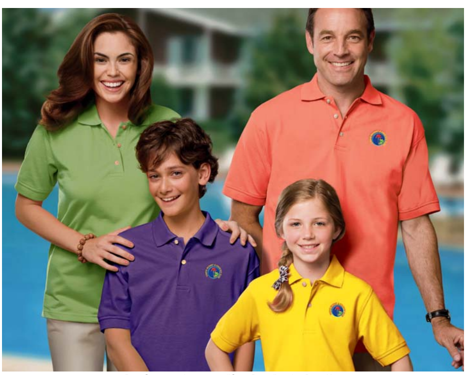
BLUE GENERATION'S EXCLUSIVE "SUPERBLEND" 60/40 PIQUE KNIT

from competitors: "When we develop a fabric that's right for our market, we offer it in a variety styles, that's our formula" Eric notes. An example: BG's "SuperBlend" 60/40 knit pique fabric "is stain-release, wash and wear, features fade resistant Color Lock technology, and is exclusive to Blue Generation," he says. "We run it in men's, ladies', and vouth sizes, long and short sleeves, with and without a pocket. We also offer a tipped-col-