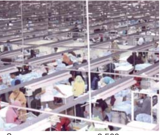
SEWING FACILITY WITH OVER 2.500 WORKERS

are the sewing machines ... more than 2,500 workers in the Egyptian facility alone." "There is a considerable capital investment in the facility," Eric notes.