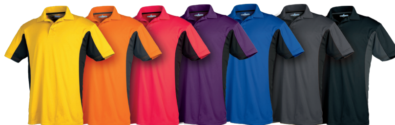
YELLOW/BLACK ORANGE/GRAPHITE RED/BLACK PURPLE/BLACK ROYAL/BLACK GRAPHITE/BLACK BLACK/GRAPHITE

For a shirt that won't sacrifice style for performance, look no further than this 4.2 oz. women's color block snag-resistant wicking polo. This fashion-forward item features BLU-X-DRI protection to keep you dry and comfortable no matter what the activity. It has stain-release technology, a taped neck and shoulder, hemmed cuffs, a rib-knit and curl-free collar, a tag-free label and contrasting side panels. It is available in seven colors and in sizes from S to 4XL.