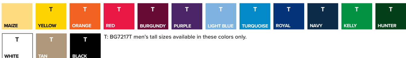
T: BG7217T men's tall sizes available in these colors only.

This trendy shirt won't sacrifice style for toughness! Made from a 65% polyester/35% cotton blend, this men's long-sleeve shirt is treated with Teflon fabric protector for stain resistance, assuring it can stand up to the toughest elements. It features a soft-touch finish, wrinkle resistance, a button-down collar, adjustable cuffs, a button-sleeve placket, a double-back yoke, two side back pleats, a patch pocket with pencil compartment and bone-horn buttons. It is available in several colors and sizes ranging from XS to 6XL including Tall sizes: LT-3XLT.