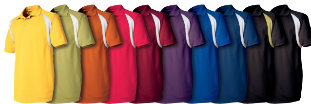
YELLOW/ WHITE VEGAS GOLD/ WHITE BURNT ORANGE/ WHITE RED/ WHITE BURGUNDY/ WHITE PURPLE/ WHITE ROYAL/ WHITE NAVY/ WHITE BLACK/ VEGAS GOLD* BLACK/ WHITE

Perfect for the golf course, tennis court and much more, this men's 5 oz. short-sleeve raglan polo will keep you cool under pressure! Made of 100% polyester, this stylish item features advanced 3M Scotchgard moisture-wicking technology, which draws moisture from the skin to the surface of the shirt to keep your dry and comfortable. It has a curl-free collar, a V-neck placket with box-stitch detail, hemmed cuffs, shoulders, a straight bottom, side vents and pearlized buttons. Available in sizes from S to 6XL and in several colors, this popular polo will make a lasting impression.